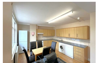
FIP 1TH FLOOR