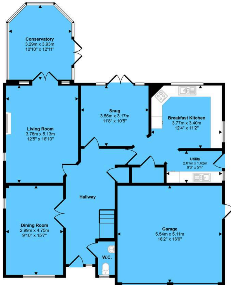
Ground Floor Approx 128 sq m / 1376 sq ft

Approx Gross Internal Area 234 sq m / 2522 sq ft