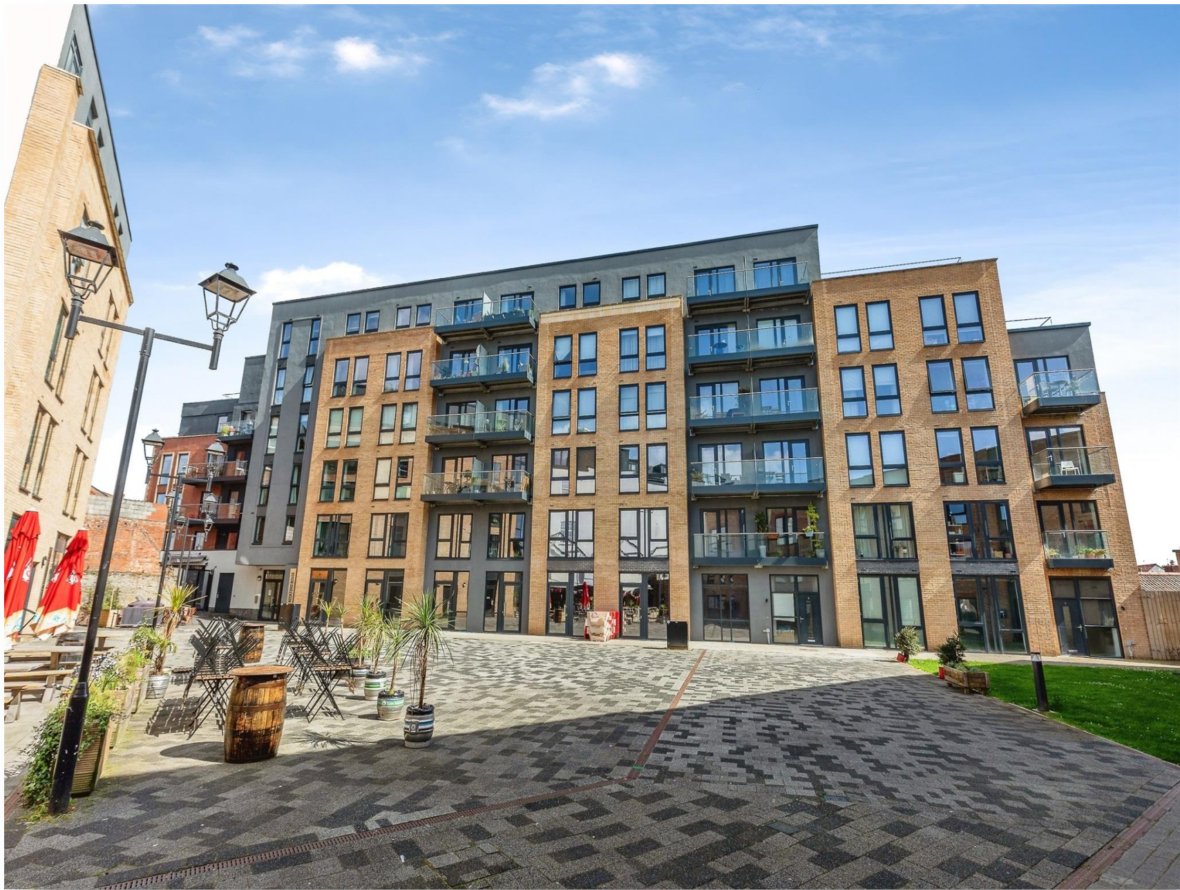
Beckford House Carmen Beckford Street, Bristol BS1 3FD