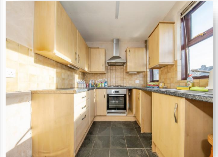
Goldsmith Road, Ipswich, IP1 6JD