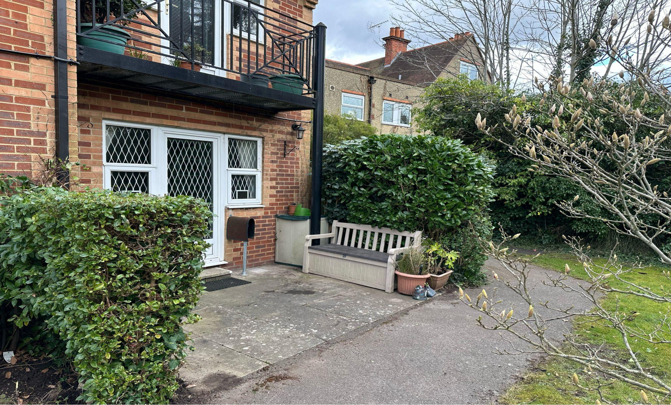
Marlborough House Northcourt Avenue, Reading RG2 7BH