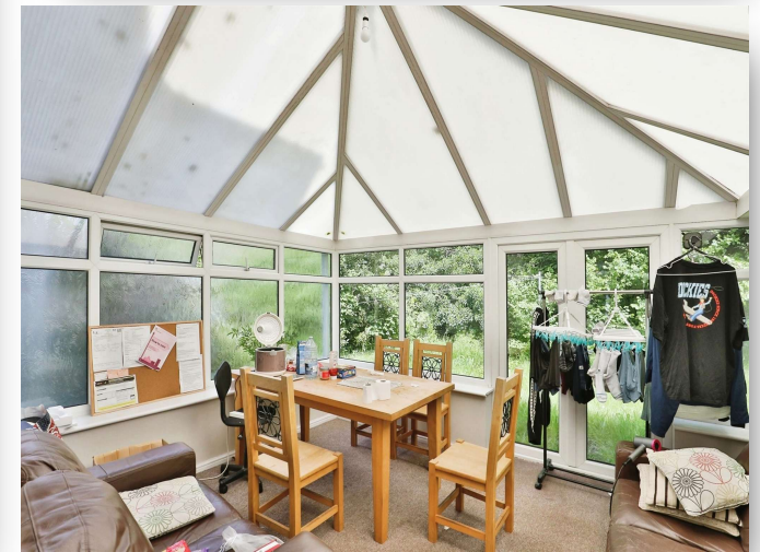
Friends Road, Norwich NR5 8HN