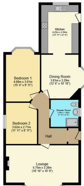
Floor Plan Floor area 89.9 sq.m. (968 sq.ft.)

Total floor area: 89.9 sq.m. (968 sq.ft.)