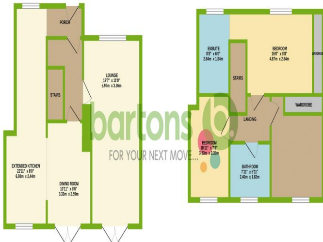
1ST FLOOR 485 sq.ft. (45.1 sq.m.) approx.

TOTAL FLOOR AREA: 1010 sq.ft. (93.9 sq.m.) approx.