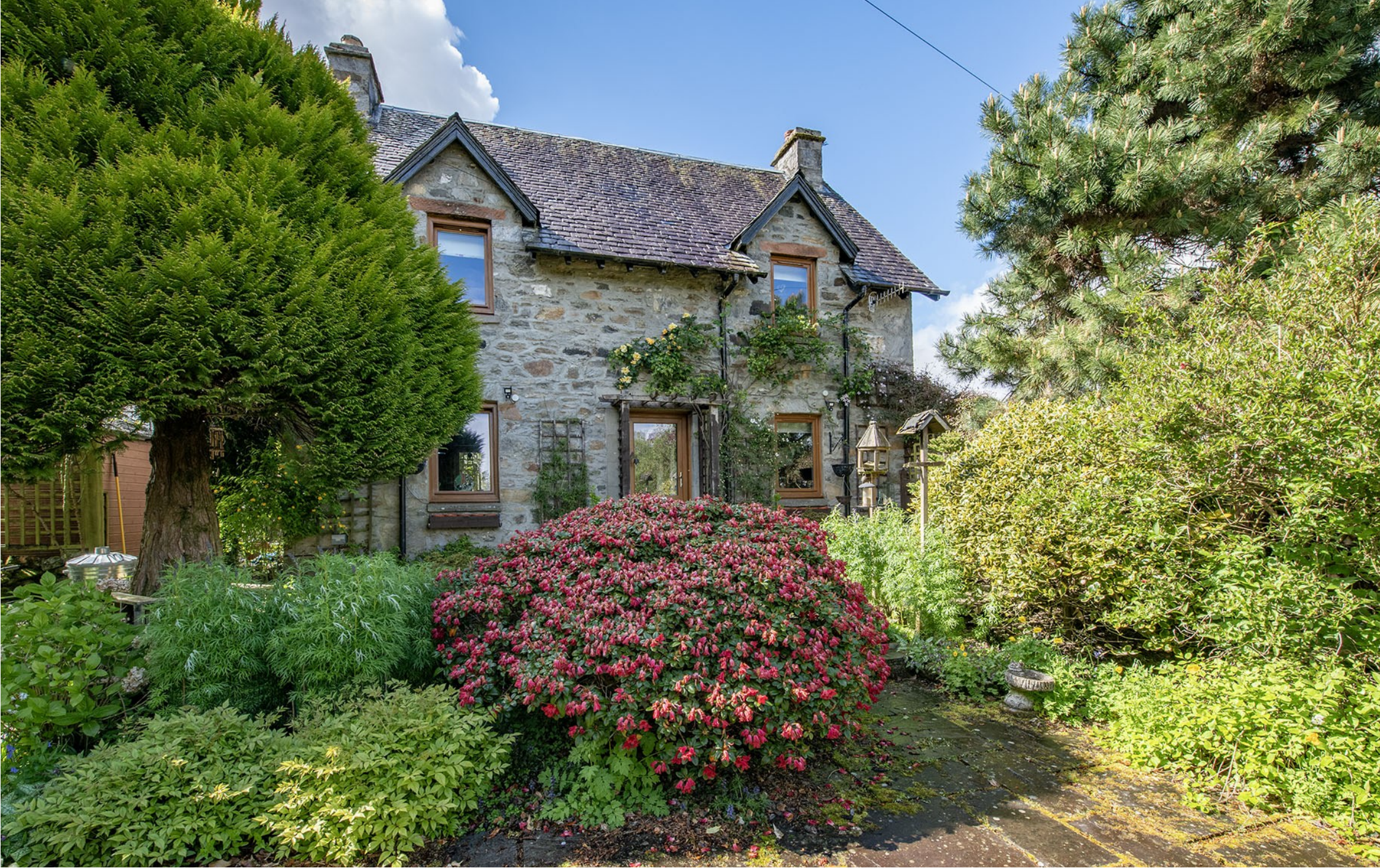
Alpine Cottage, MAIN STREET, KILLIN, FK21 8UT