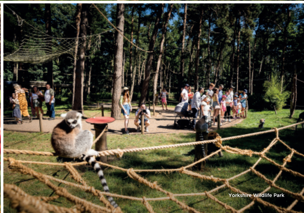
Yorkshire Wildlife Park