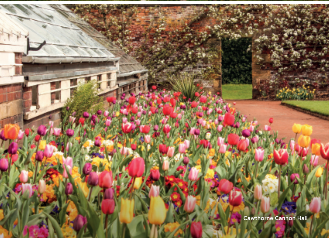
Cawthorne Cannon Hall