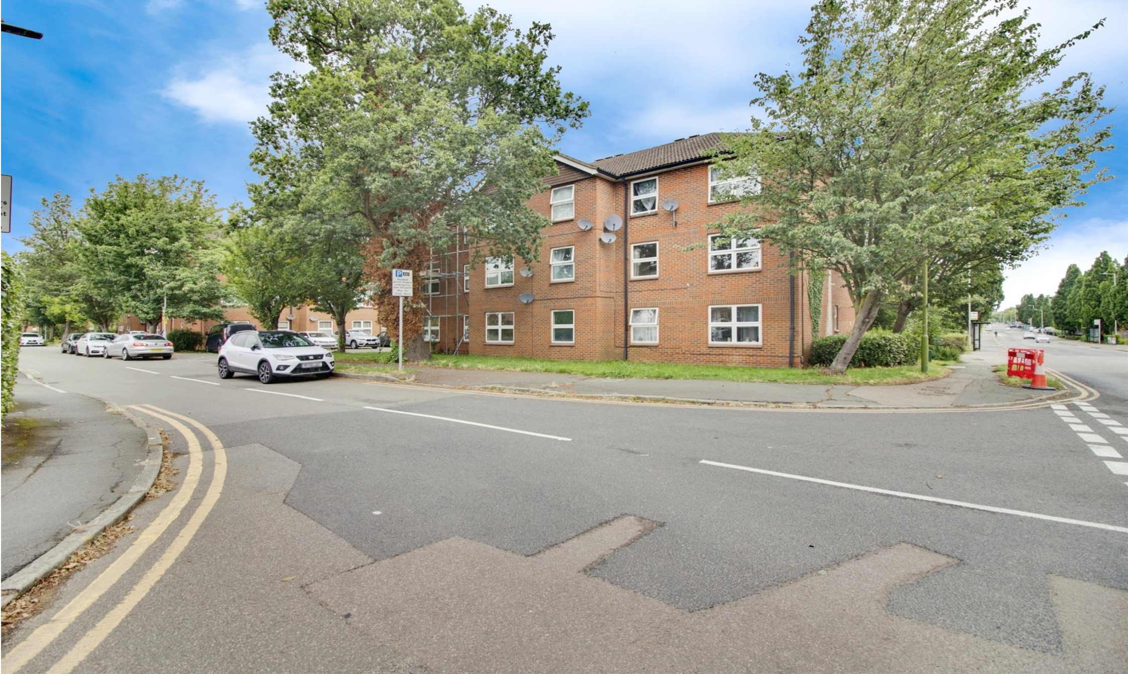
Broadwater Crescent, Welwyn Garden City AL7 3TT