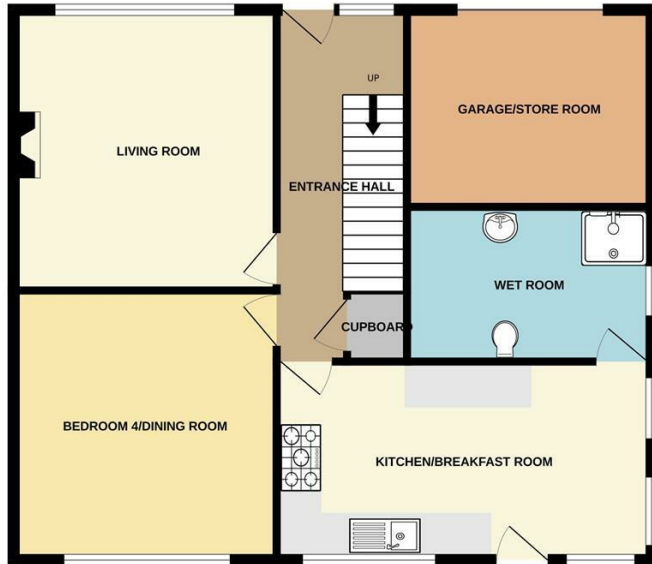
GROUND FLOOR 826 sq.ft. (76.8 sq.m.) approx.