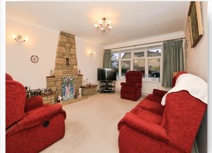
Portman Close, Peterborough PE3 9RJ