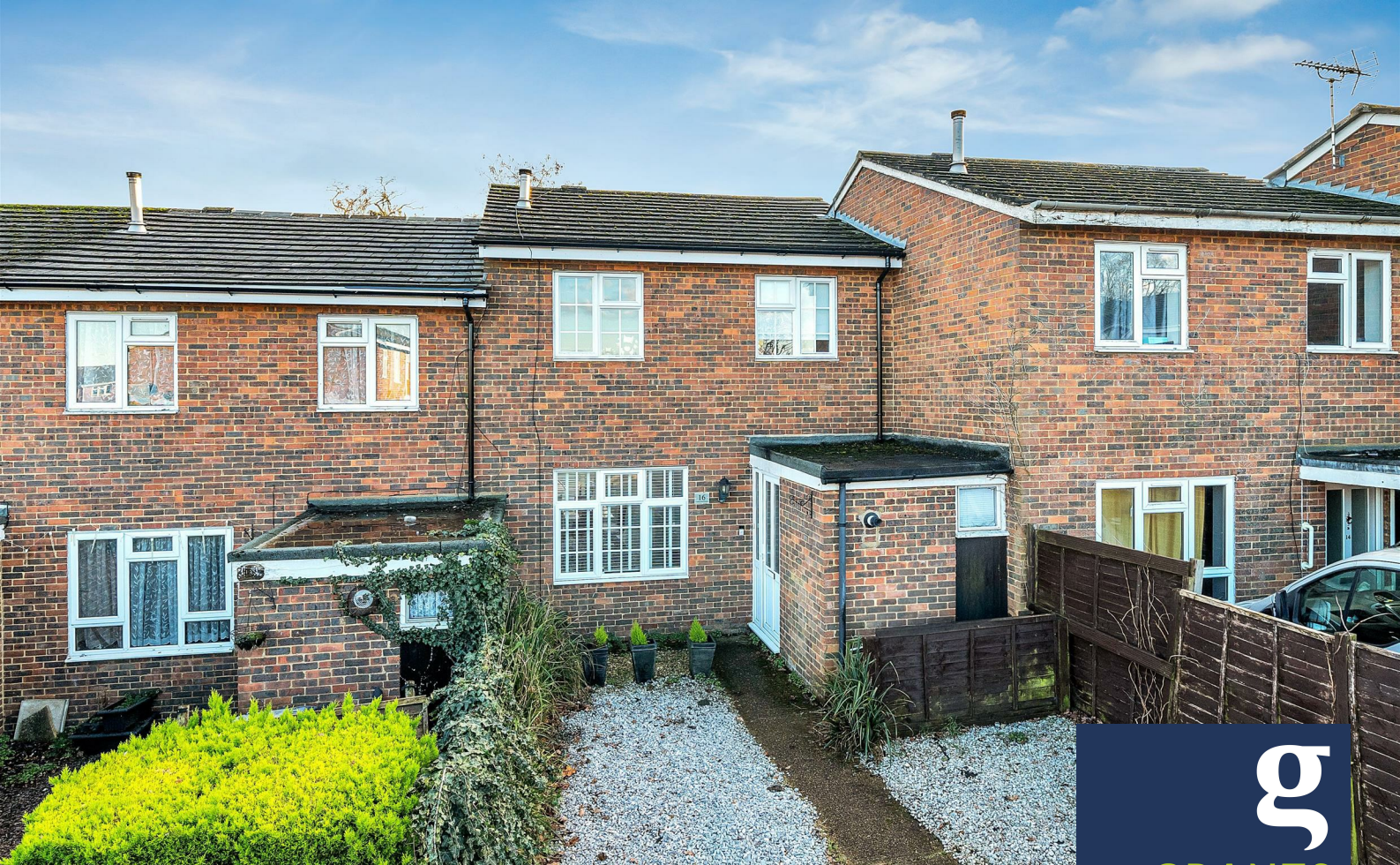
Templefield Close, Addlestone, KT15 1LR