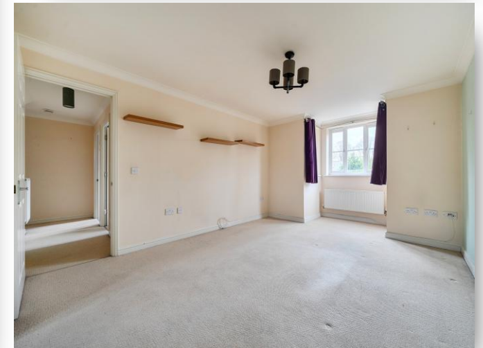
Flat 9 Westgate, 1 Highway Avenue, Maidenhead SL6 5EE