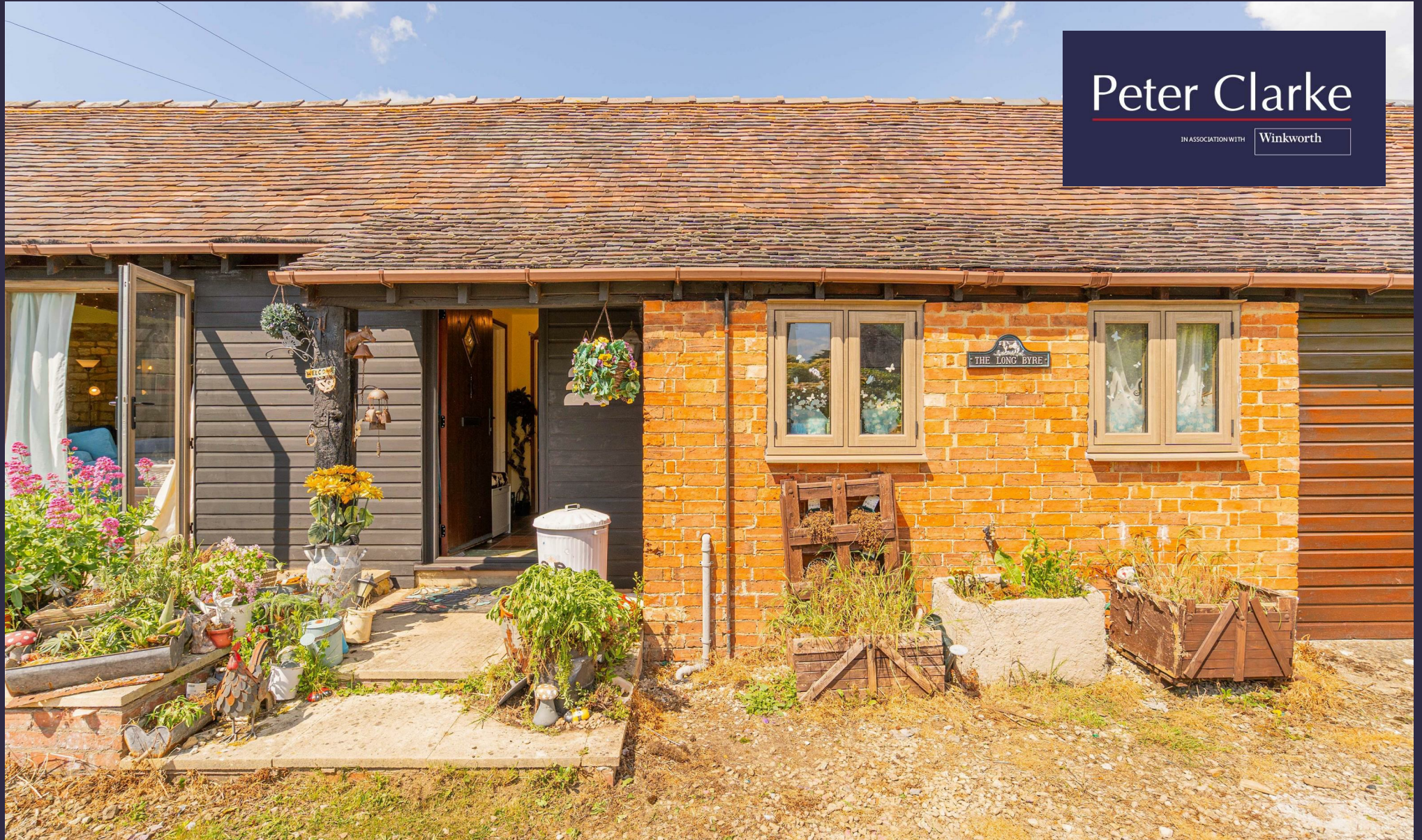
The Long Byre Pillerton Hersey, Pillerton Hersey, Warwick, CV35 0QA