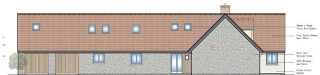
PROPOSED NORTH (FRONT) ELEVATION 1:100