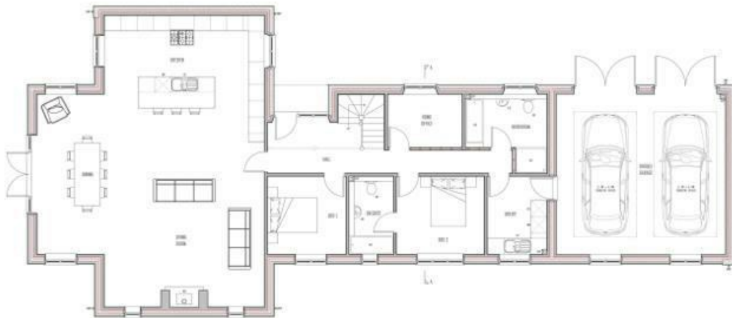
PROPOSED GROUND FLOOR PLAN 1:50