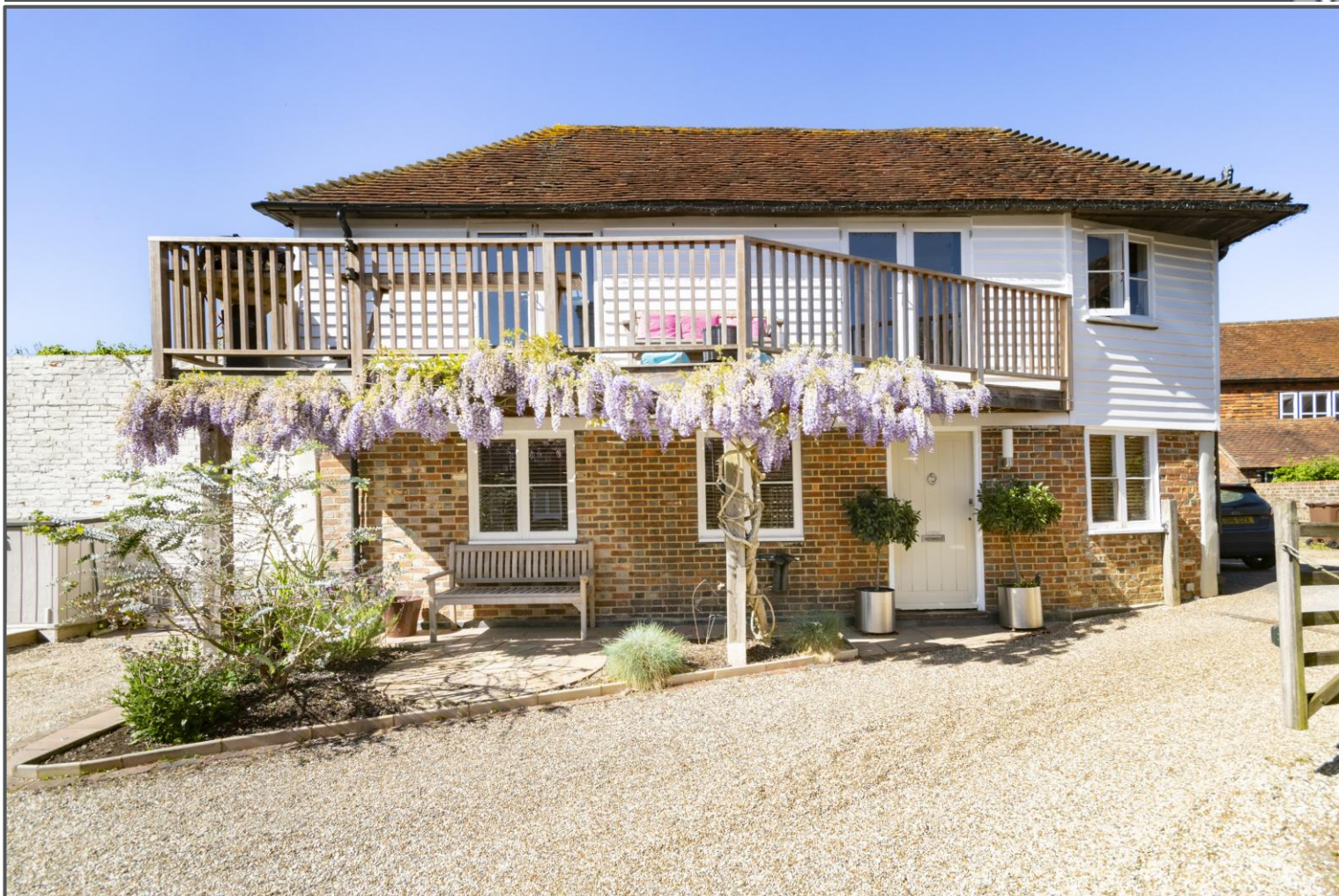
Ham Lane, Etchingam, TN19 7ER