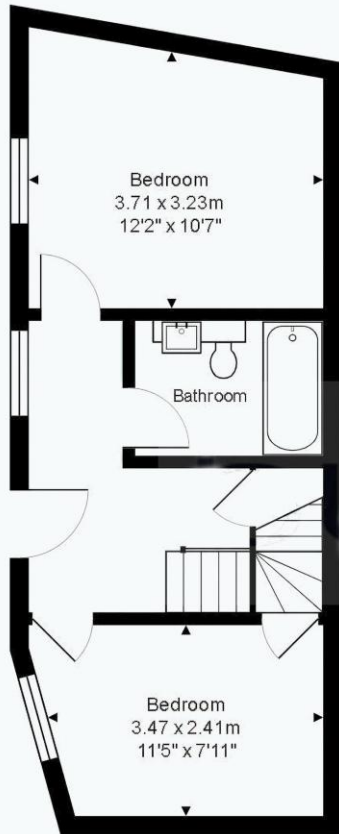
Ground Floor Area: 35.1 m 2 ... 378 ft 2