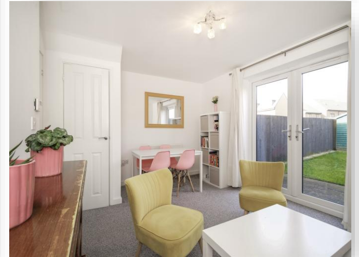
Blossom Way, Thurnscoe Rotherham S63 0AS