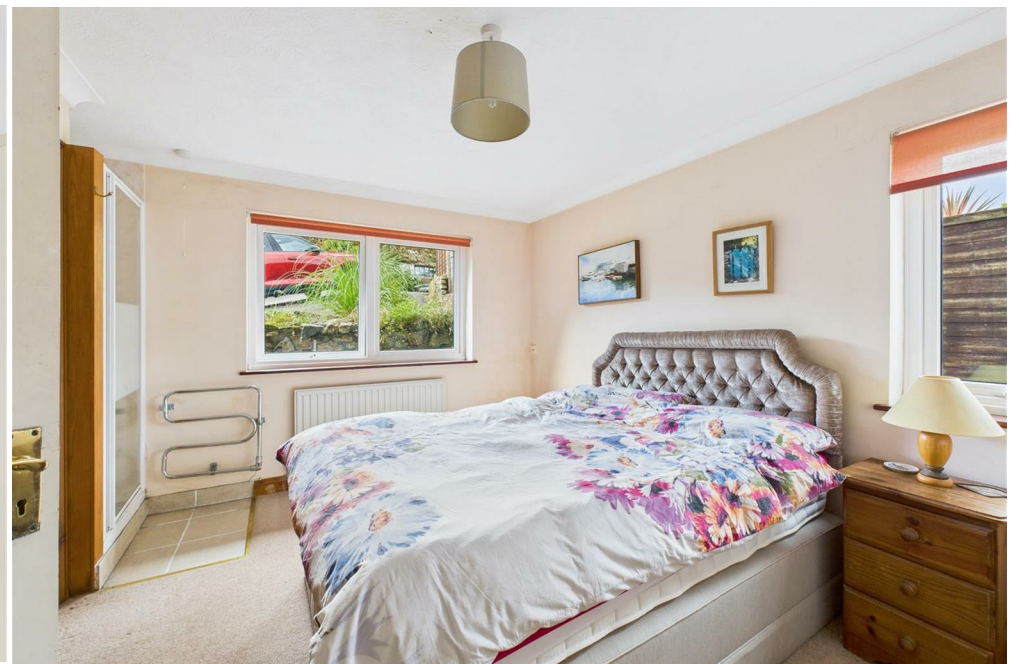
Estuary View, Lelant, St. Ives, TR26 3ES