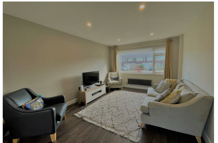
House - End Terrace (EPC Rating: D)