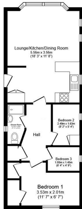
Floor Plan Floor area 52.3 sq.m. (563 sq.ft.)

Total floor area: 52.3 sq.m. (563 sq.ft.)