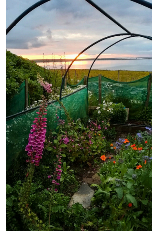
Garden in bloom