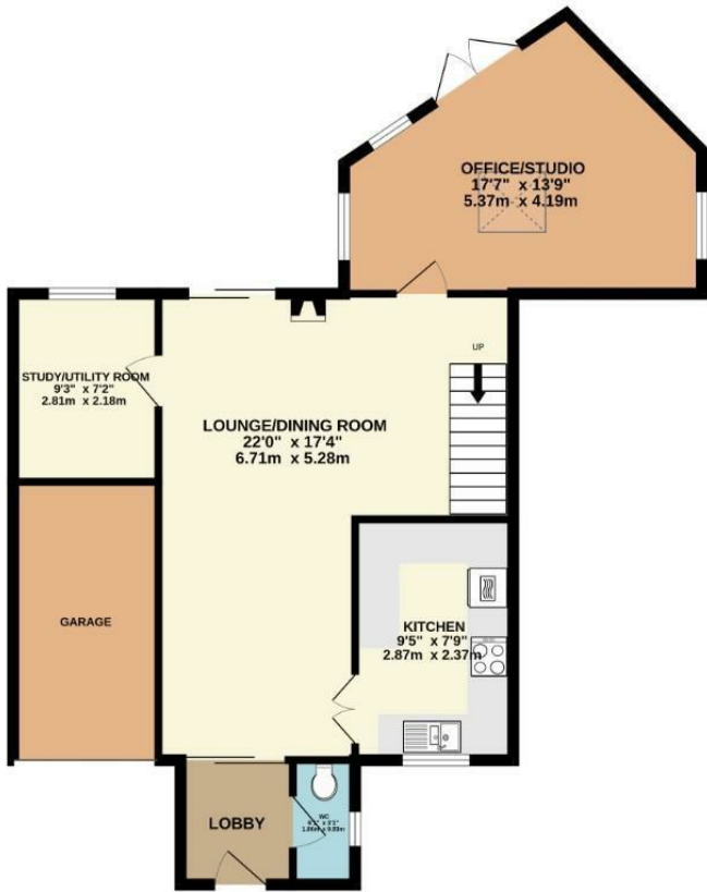
GROUND FLOOR 794 sq.ft. (73.8 sq.m.) approx.