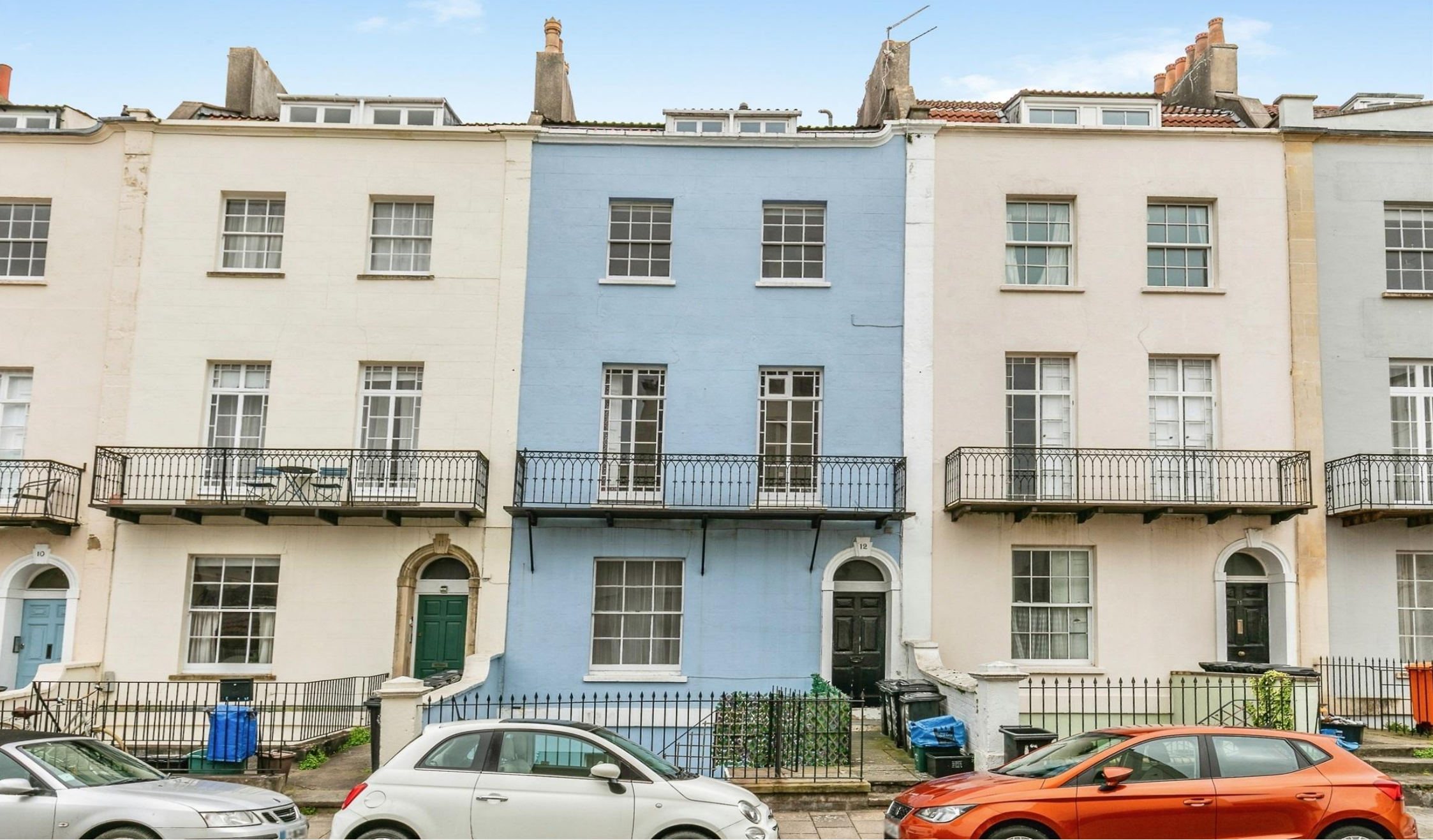
Second Floor Frederick Place, Bristol BS8 1AS