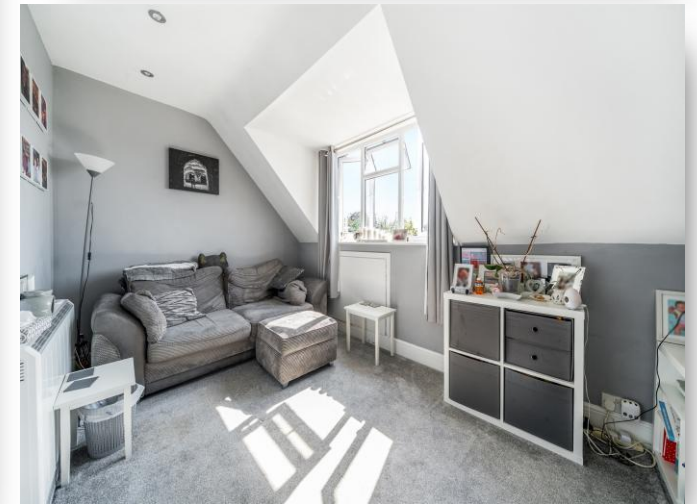
Flat 3, 15 Furze Platt Road, Maidenhead SL6 7ND