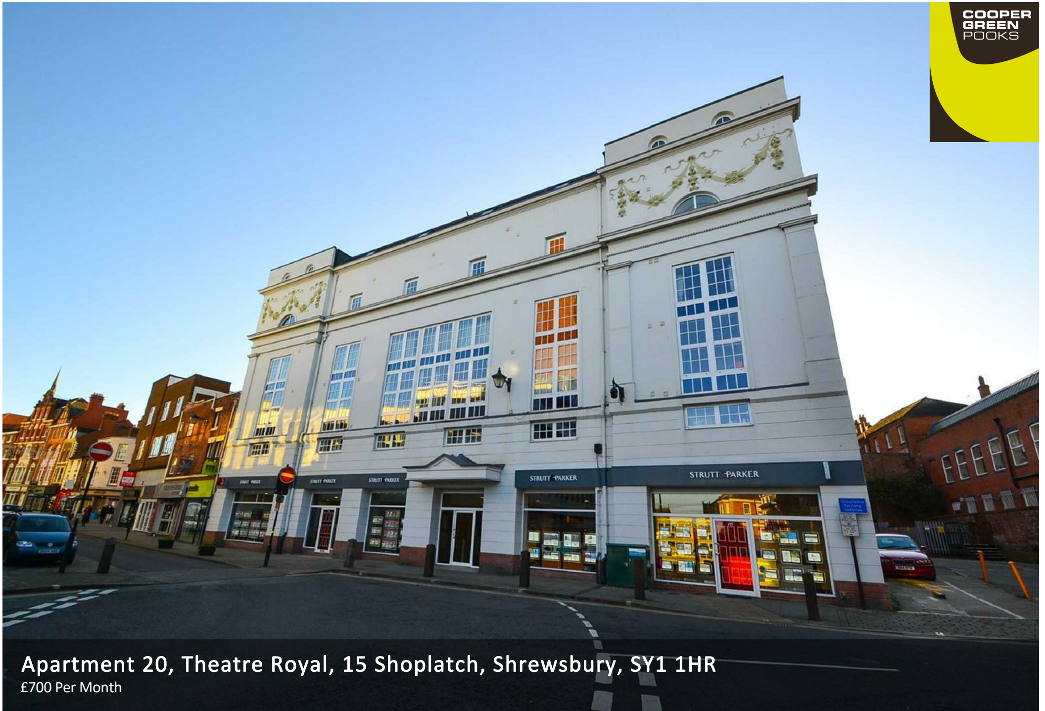
Apartment 20, Theatre Royal, 15 Shoplatch, Shrewsbury, SY1 1HR £700 Per Month