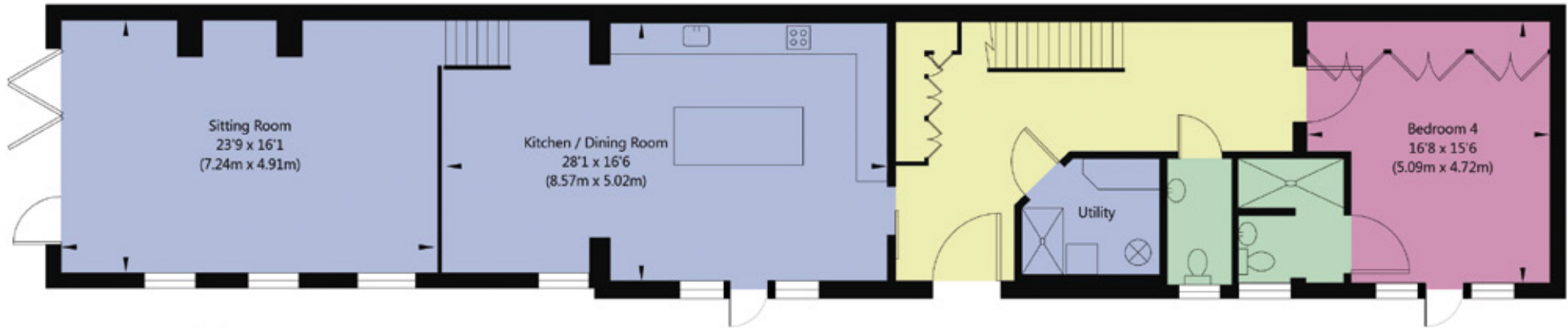
Ground Floor GROSS INTERNAL FLOOR AREA APPROX. 1551 SQ FT / 144.13 SQ M

For identification only. Not to scale. All Measurements and fixtures including doors and windows are approximate and should be independently verified.