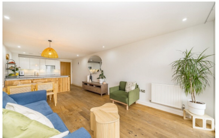
Seren Park Gardens, SE3