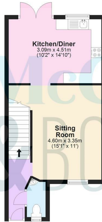
Ground Floor Approx. 38.1 sq. metres (410.4 sq. feet)