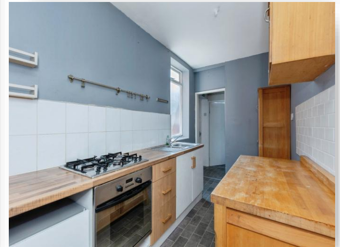
Cambridge Street, Leicester LE3 0JP