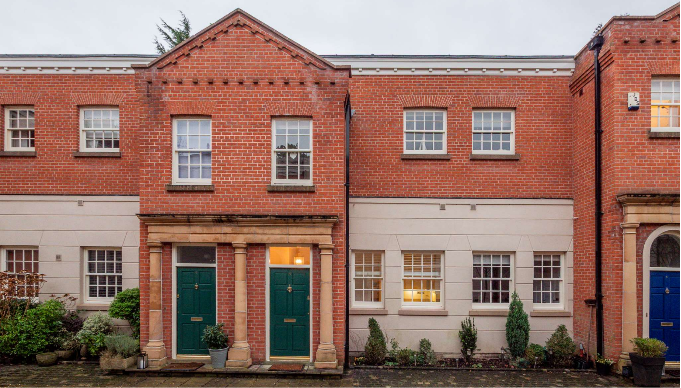
Tabley The Stables, Tabley House