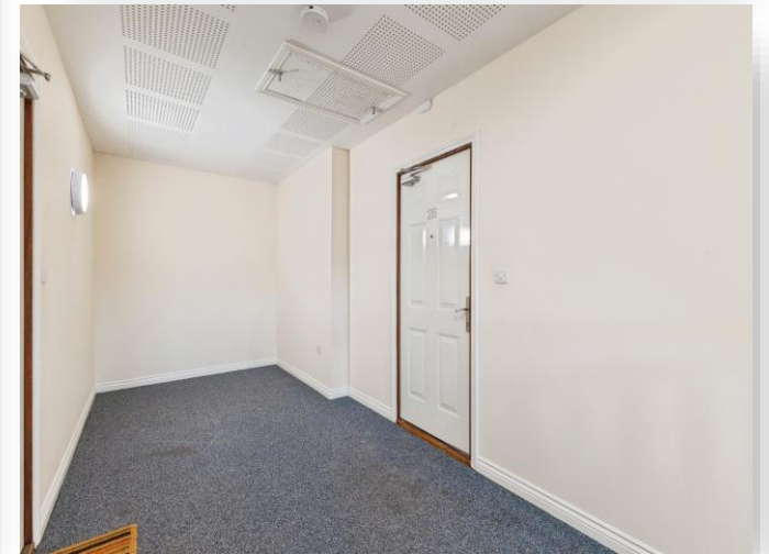
Rockingham Court, Middlesbrough TS5 7BN