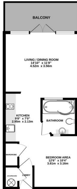
22 MADISON WHARF

While every attempt has been made to ensure the accuracy of the floorplan contained here, measurements of doors, windows, rooms and any other items are approximate and no responsibility is taken for any error, omission or mis-statement. This plan is for illustrative purposes only and should be used as such by any prospective purchaser. The services, fixtures and appliances shown have not been tested and no guarantee is given for their condition or fitness for use or green. Made with MapInfo 12.000