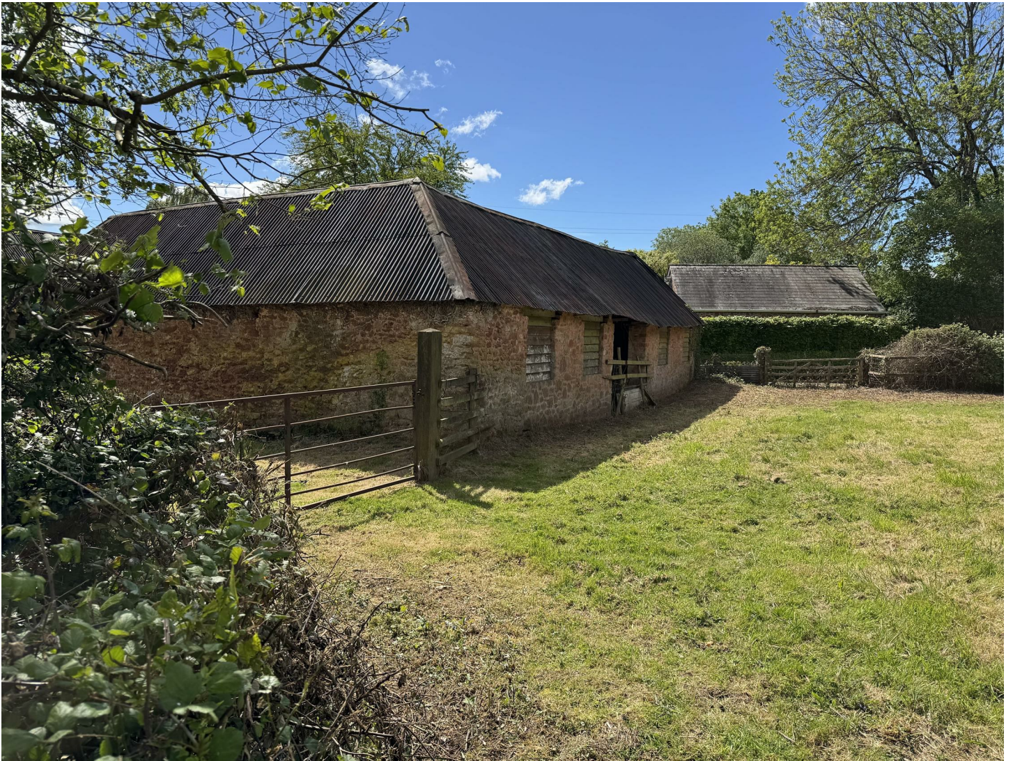
The South Barn