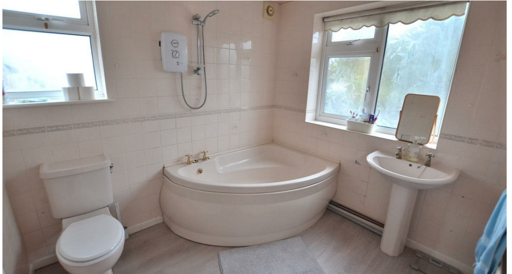
58 Paterson Place, Shepshed, Leicestershire, LE12 9RX