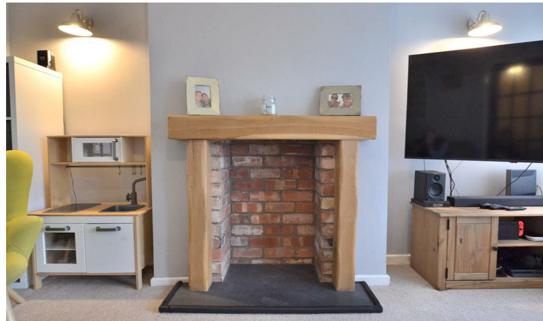
58 Paterson Place, Shepshed, Leicestershire, LE12 9RX