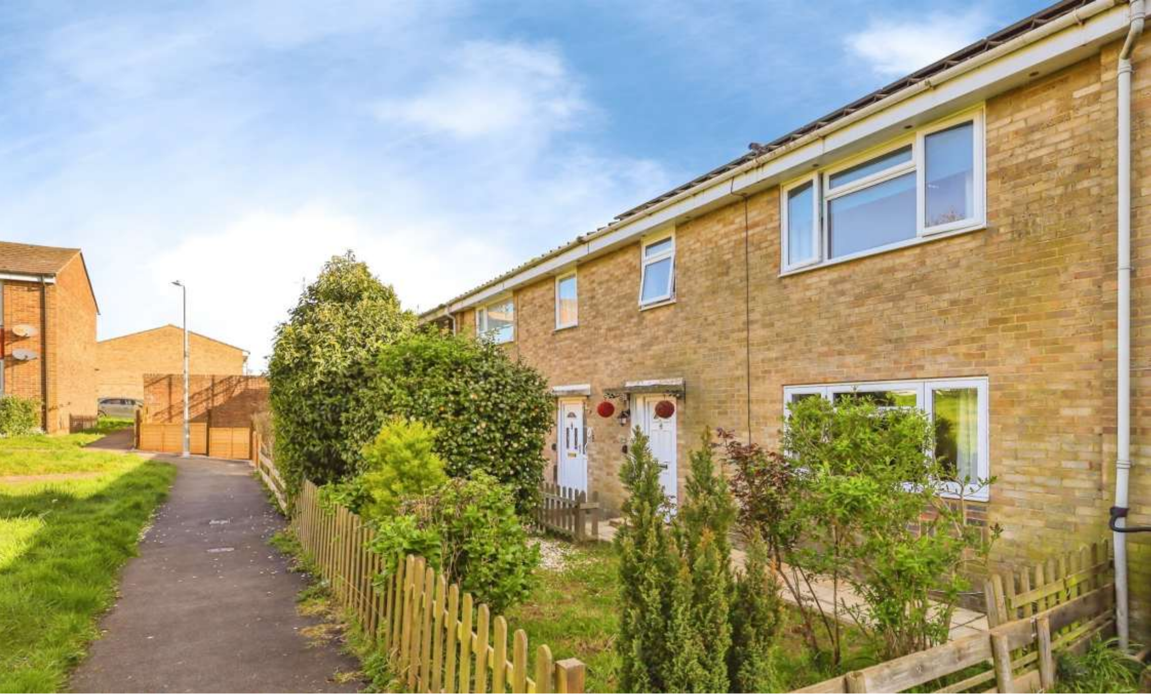
Merlin Court, Observatory View, Hailsham BN27 2PS