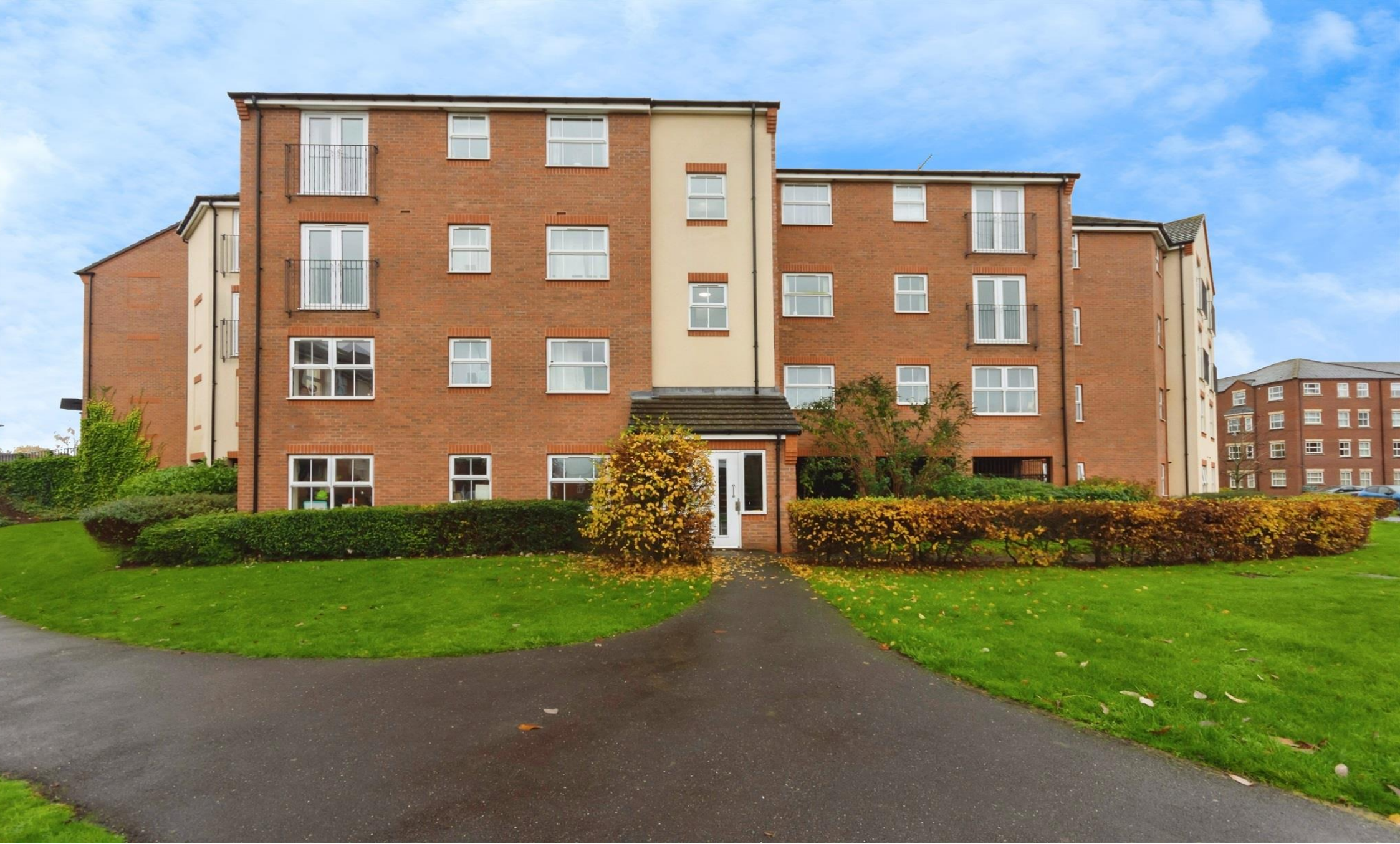
Avery Court Wharf Lane, Solihull B91 2NG

Not for marketing purposes INTERNAL USE ONLY