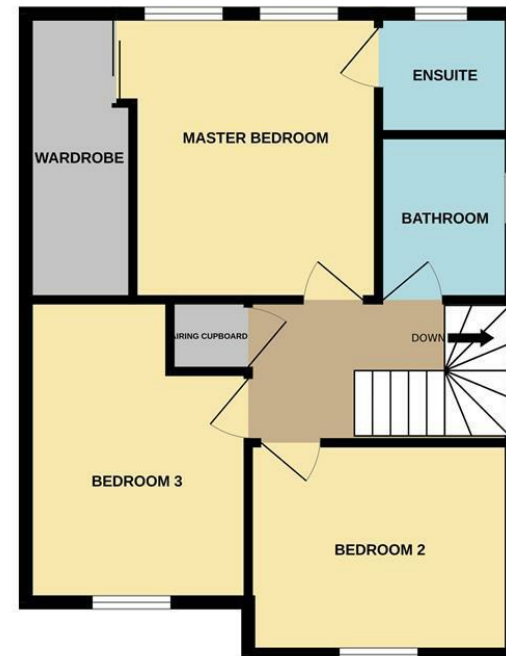
1ST FLOOR 534 sq.ft. (49.6 sq.m.) approx.