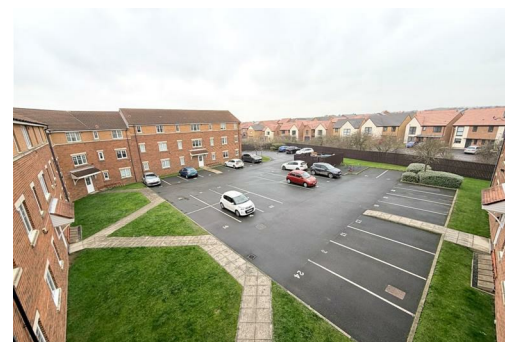
23 Strawberry Apartments, Hartlepool, TS26 0RP

We are acting in the sale of the above property and have received an offer of £74,500 on the above property.