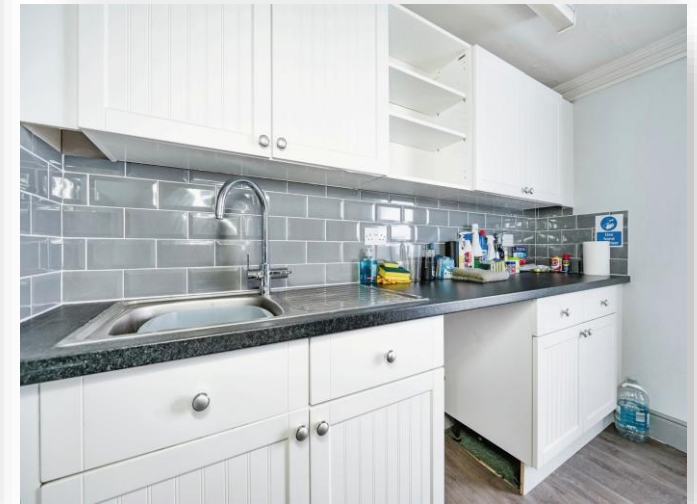
Old Market, Wisbech PE13 1NB