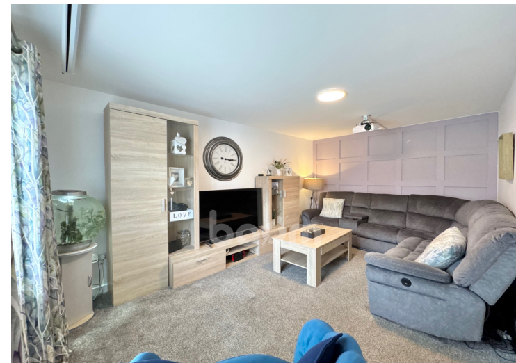
Auldlea Gardens, Beith