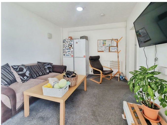
Living Room 10'6 x 10 (3.20m x 3.05m)