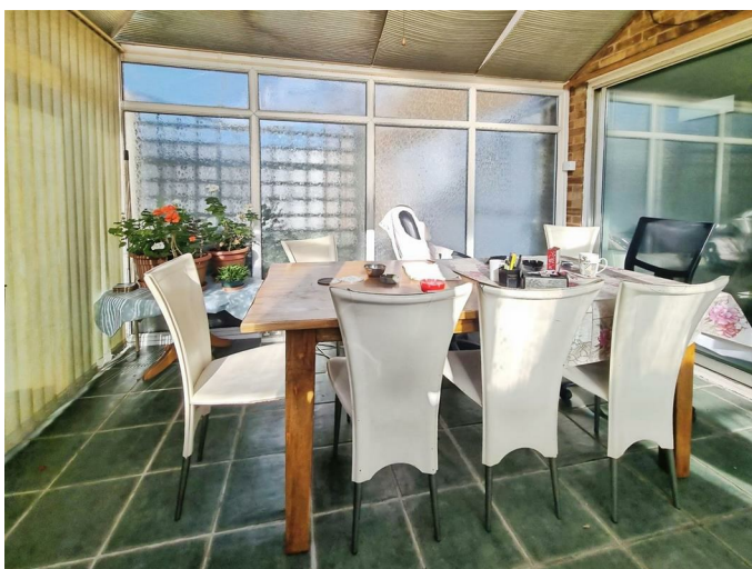
Conservatory 11'9 x 9 (3.58m x 2.74m)