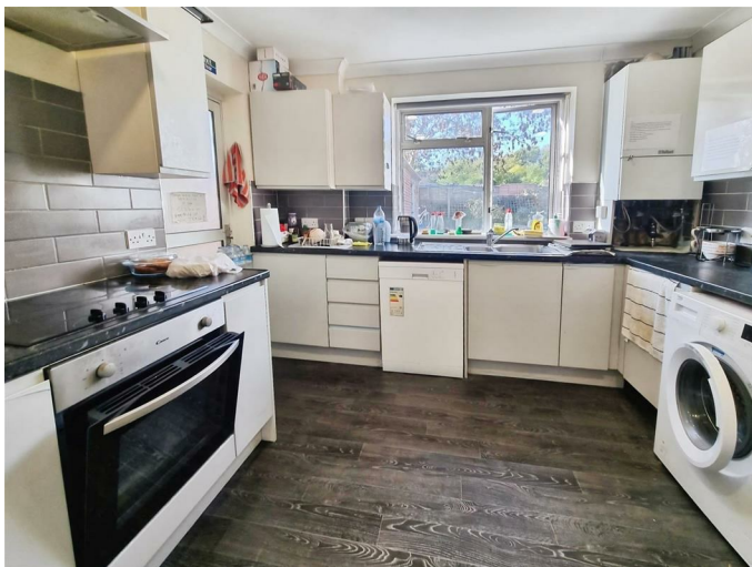
Fitted Kitchen 10'11 x 10'6 (3.33m x 3.20m)