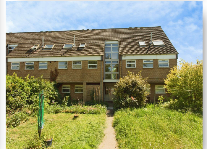
George Lambton Avenue, Newmarket, CB8 0BG