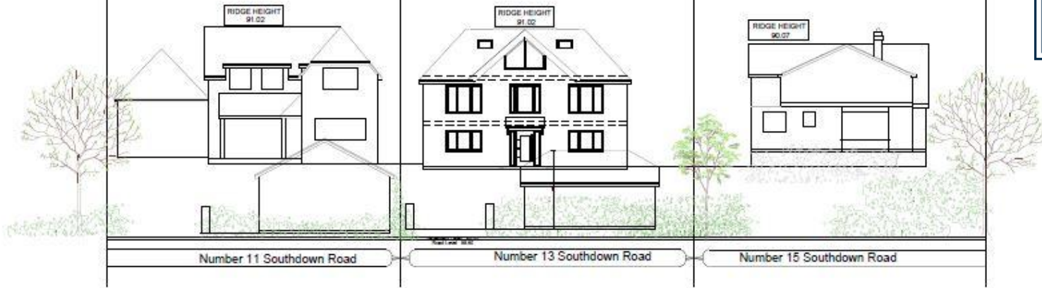
Proposed Street Elevation Scale A1 1:100, A3 1:200