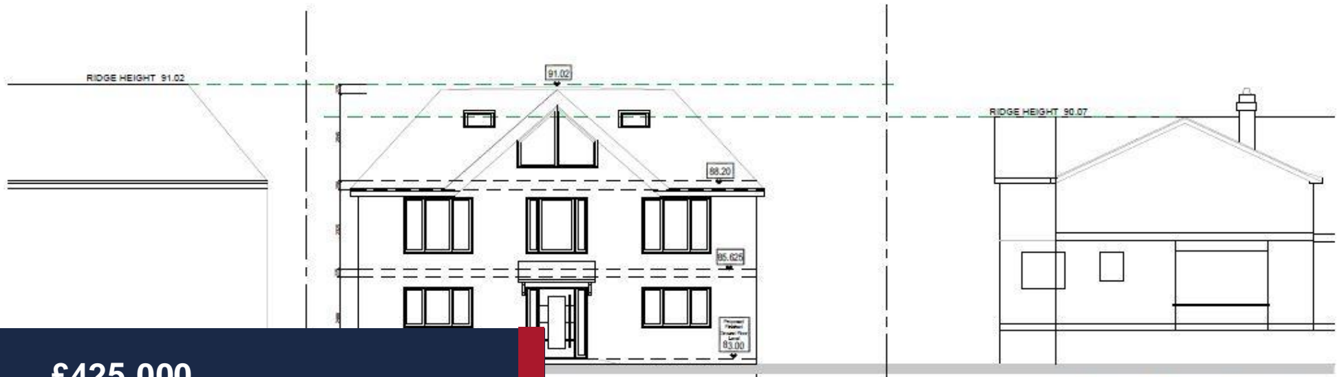
Drawing According to Application Reference 24758/002 No.15 Southdown Road

£425,000 13 Southdown Road Horndean, PO8 0ET