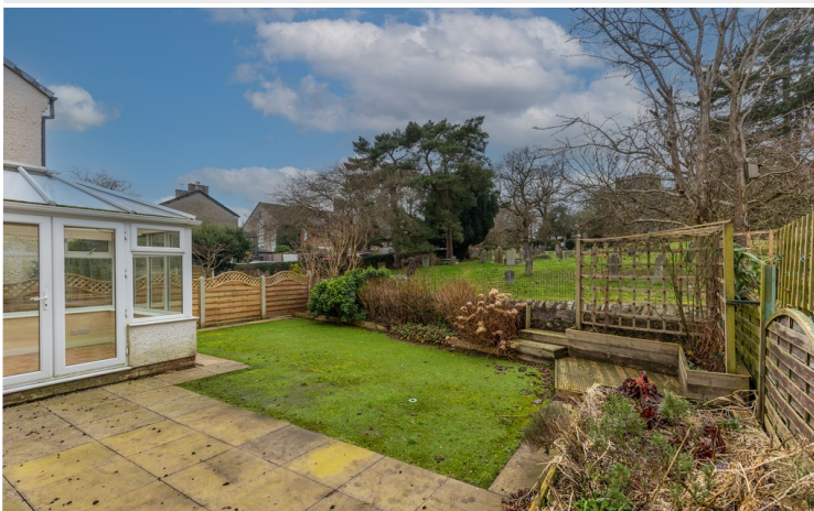
Rear Garden Area