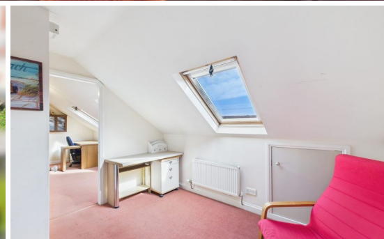
6 WHIN GREEN, SLEIGHTS- 4 bed Detached Bungalow -£325,000