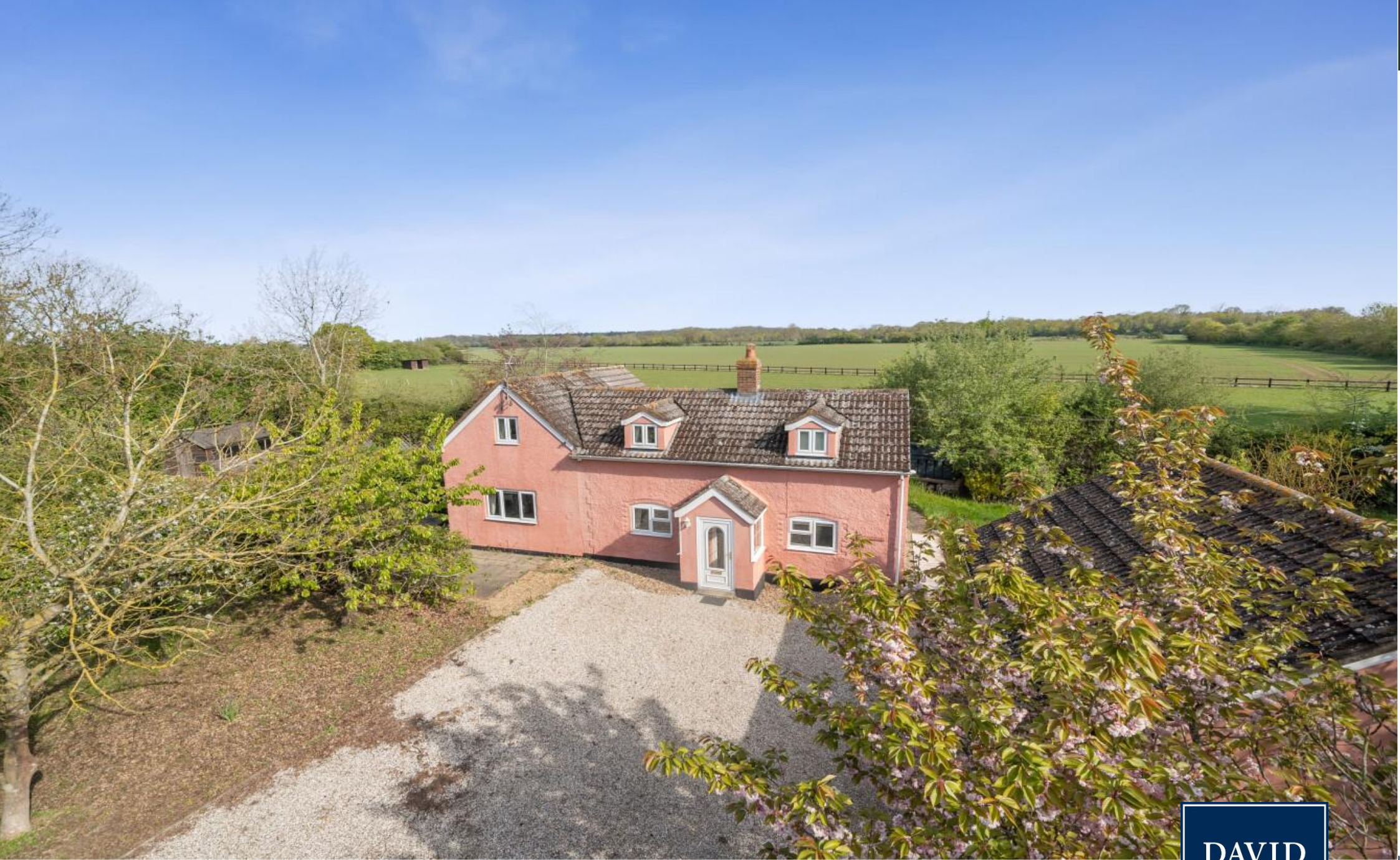
Walnut Tree Cottage, Great Green, Thurston, Suffolk.