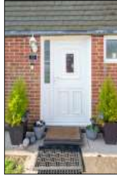
Front Door, Cloakroom