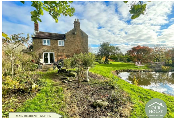
MAIN RESIDENCE GARDEN