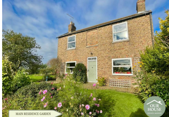
MAIN RESIDENCE GARDEN